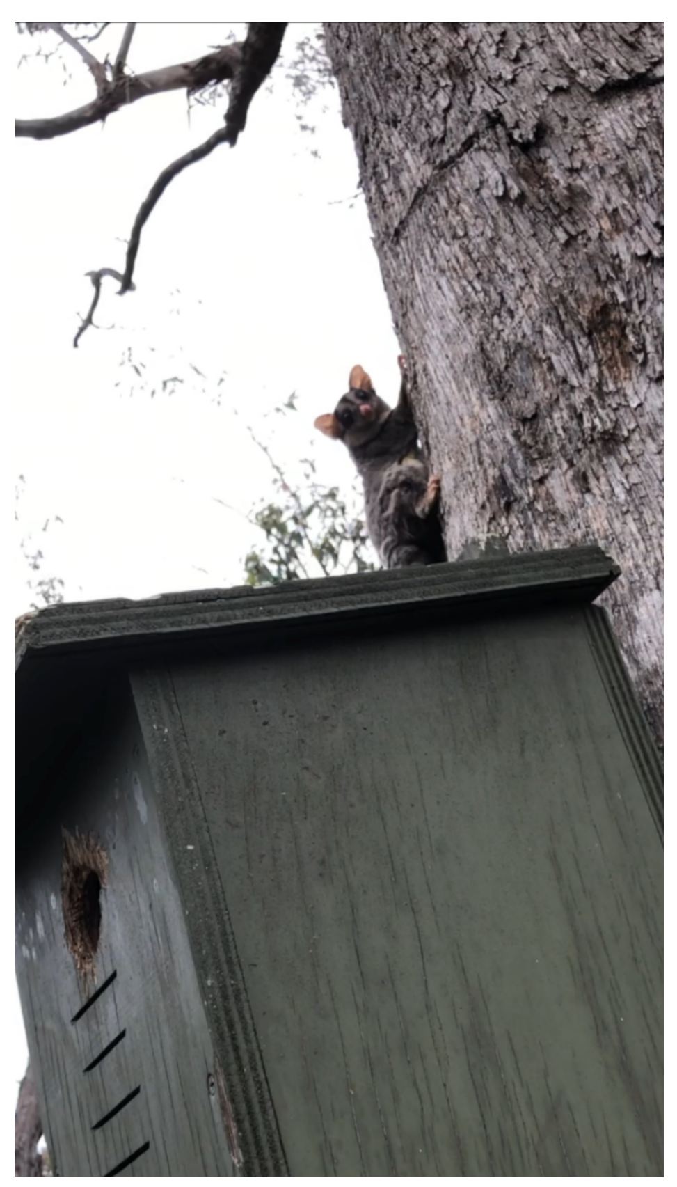
Sugar Glider in Kalimna Park